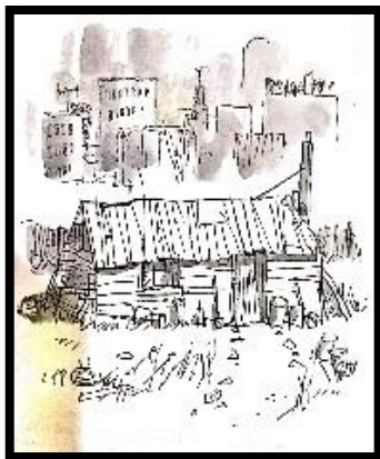
Figure 5. The view of village

Third, symbolic process. It is to represent what the participant means (p. 105). Then, there are 2 former kinds of symbolic processes, symbolic attribute and symbolic suggestive. Symbolic attribute is the participant which visualized the meaning or identity by itself. In other words, the human participants commonly pose for the viewer than action (p. 105). Symbolic suggestive just only have a participant as called the carrier or defined as the participant whose meaning based in the relation (p.105)