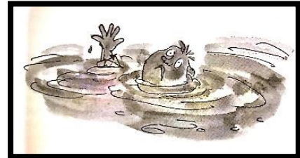
Figure 8. A young man who sink in the river

c. Analytical process: it represents participants in terms of a part-whole structure (p. 87). The couple of married have interaction by gaze their eyes to the reader as the whole (carrier) and their expression as the possessive attributes.