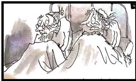
Figure 11. The 4 old people Taken from Dahl (2001)

Source: Children book Charlie and The Chocolate Factory