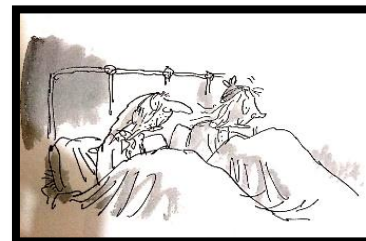
Figure 13. The couple of old people Taken from Dahl (2001) Source: Children book Charlie and The Chocolate Factory

According to Painter et al. (2012, p.78) the circumstantial meaning refers to an image is primarily concerned with giving details of the location in space, although depictions of clocks, lighting, the moon, etc. can also be used to indicate the location in time. The inter-circumstance is the details of the degree of consistency or variation and where the consistency or variation itself matters. These are the main options the network provides for inter-environment relationships between consecutive images (p. 79).