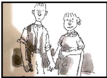
Figure 3. The couple of married Taken from Dahl (2001)

Narrative structure is the connection between participants and vectors as the main sign of visual proposition that represent process relation each other. In semiotic unit must be able to represent aspects of the experience people, it called as ideational meaning. In other words, it must be able to represent experience objects and their relationships outside the system Kress & van Leeuwen (2006).