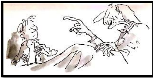
Figure 4. An old lady and a young man Taken from Dahl (2001)

Source: Children book Charlie and The Chocolate Factory