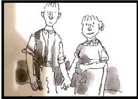
Figure 7. The couple of married

As stated by Kress & van Leeuwen (2006), embedding represents more than 1 structure or process. To be more clearly, it means the embedding is complex structure that analyzes picture which represent at least 2 structure or process (p. 106).