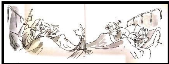
Figure 12. The four old people and a young man

In this kind of image classified into appear of character appearance. Based on Painter et al. (2012), kind of appear in character appearance is the first of character's depiction (p. 65). In this children book, there are 4 old people that appear as the grandmother and grandfather of a young man named Charlie. It is their first depiction in this book as the introduction of character on the children book.