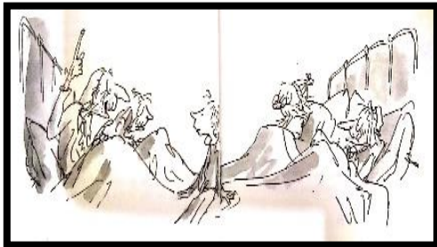
Figure 9. The 4 old people and a young man

divides into 2 kinds of features, complete depiction and metonymic depiction (p. 65). Complete depiction is the whole of body including face or head (p. 65). Then, metonymic depiction there are body part (the depiction part of body without face or head) and shadow or silhouette (the depiction of the shadow or outline from whole body or part of body) (p. 65).