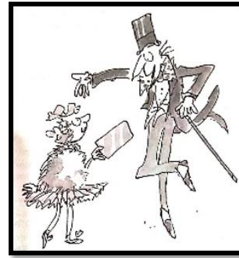
Figure 10. A cap man and a young woman

In this kind of data, it is classified into complete depiction in character manifestation. By seeing this image, there are 4 old people and a young man sitting down in the bed with facing each other. One of old man pointing up his finger as interaction to a young man. As stated by Painter, complete depiction is the depiction that manifest the character to visualize the whole of body including face or head Painter et al. (2012, p.65) .It can be seen, all of characters in the image above showing their heads and body, although foot of the old people (part of body) covered by blanket, it also classified into complete depiction that still showing head or face.