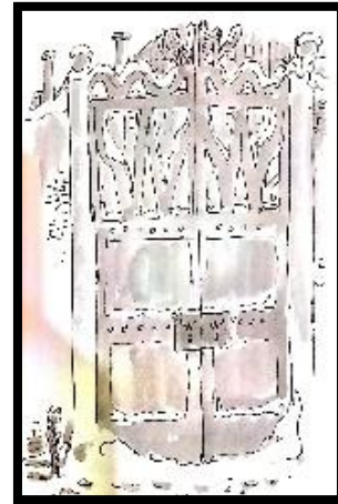
Figure 6. The depiction of gate Taken from Dahl (2001)

because it visualized an area (carrier) that described by a wooden house and its different from city described by the tall building behind a wooden house, like economic development, building concept, lifestyle as meaning or identity itself. It represented the villages around the city. So, the reader will easily find representation of villages around city.