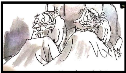
Figure 14. The other couple of old people

In the first image, the data above classified into sustain degree (maintain context: new perspective). As Painter et al. (2012) stated, sustain degree is the degree in circumstantiation that have same level from previous depiction (p. 79). By seeing the image, it can be seen there are two of old people who sitting in the bed facing to the right side. It is their first appearance in this book and also categorized as sustain degree followed by maintain context (setting depiction same as previous image) with new perspective as the first appearance of the image.